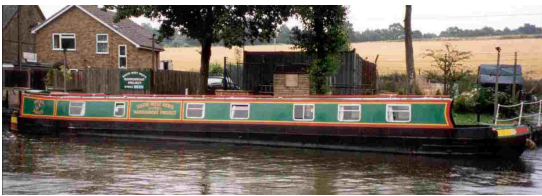
Dick's Folly at the base Old Mill Road, Hunton Bridge

It should be noted that the boat is not designed for wheelchair access.